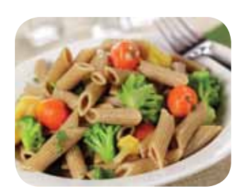
Eat the right amount of calories for you